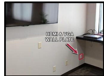
Wall Plate Location