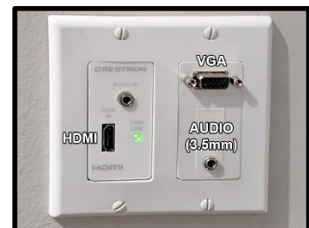
Wall Plate Ports