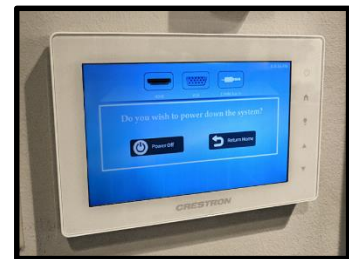
...and then press “Power Off”

If you displayed the “Do you wish to power down the system?” message by accident simply press the Return Home button to continue use of the system.