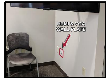
Wall Plate Location