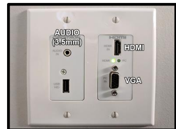
Wall Plate Ports