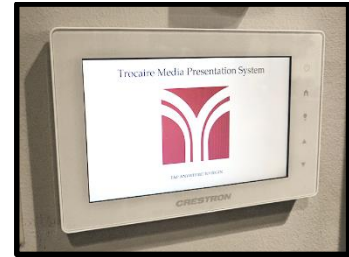
Crestron Touch Panel